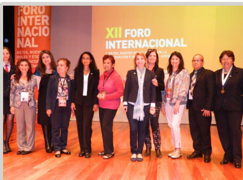
Representatives of FIT LatAm signed the Lima Declaration at the FIT Forum, Peru.

The representatives of the following associations were present: the Argentine Associations of Translators and Interpreters (AATI), the Colombian Association of Translators and Interpreters (ACTI-Colombia), the Cuban Association of Translators and Interpreters (ACTI-Cuba), the Panamanian Association of Translators and Interpreters (APTI), the