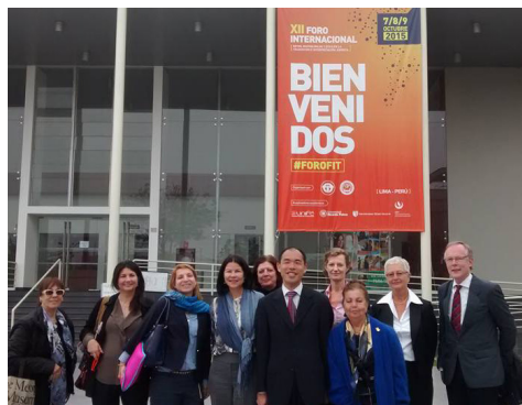
Participants of the FIT LatAm Meeting and FIT Council Members meet on the stairs leading to the Unifé auditorium, on the eve of the FIT Forum

The day closed with the General Assembly of FIT LatAm, which made a review of present accomplishments, most notably, the introduction of a dedicated page for