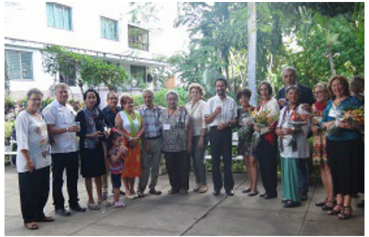
The Organising Committee with some participants and the winners of the José Rodríguez Feo Literary Translation Awards