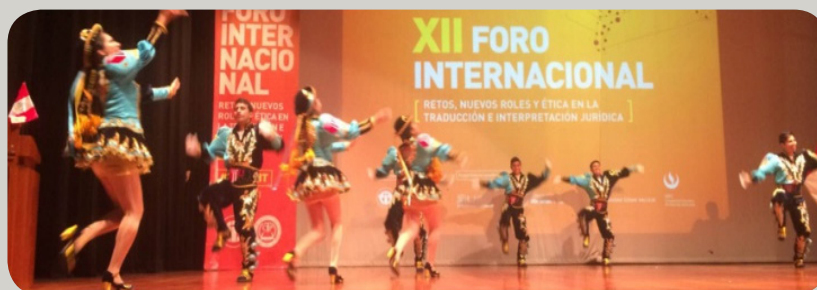
Typical dance performances by university ensembles