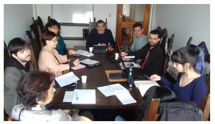
Pilot Seminar for Trainers of Literary Text Translations, 12 – 13 October 2016. Yerbabuena venue, Instituto Caro y Cuervo. Colombia

form and content present in this type of texts.