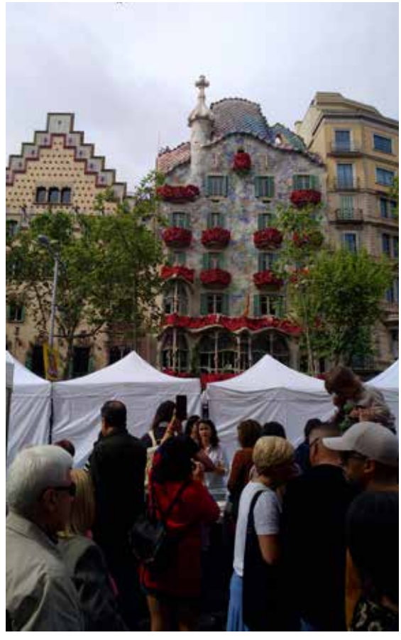
Crowd and rose decorations

After breakfast, we ascended towards Passeig de Gràcia. At the top of the avenue, we reached APTIC's colourful