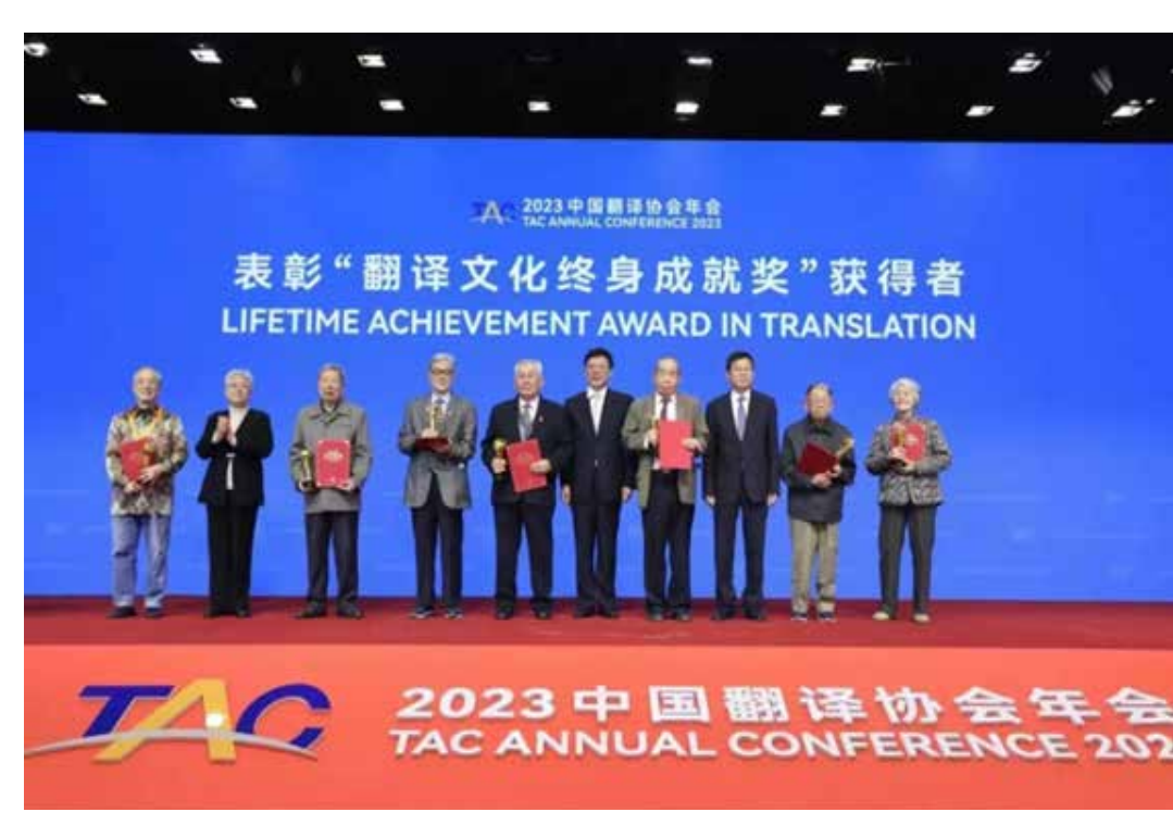
Awards ceremony for veteran translators and interpreters

contributions to the Chinese translation industry. Eleven translators and interpreters were honoured with the Lifetime Achievement Award in Translation, 115 were given the Senior Translators Award, and six received the Outstanding Foreign Translation Expert Award.