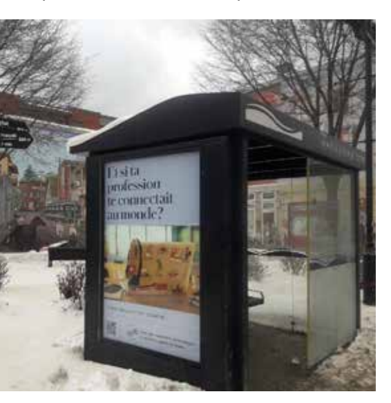
OTTIAQ advert at a bus stop

This considered policy has helped add more structure to our content, allowing us to grow our online presence and increase public awareness of our professions.