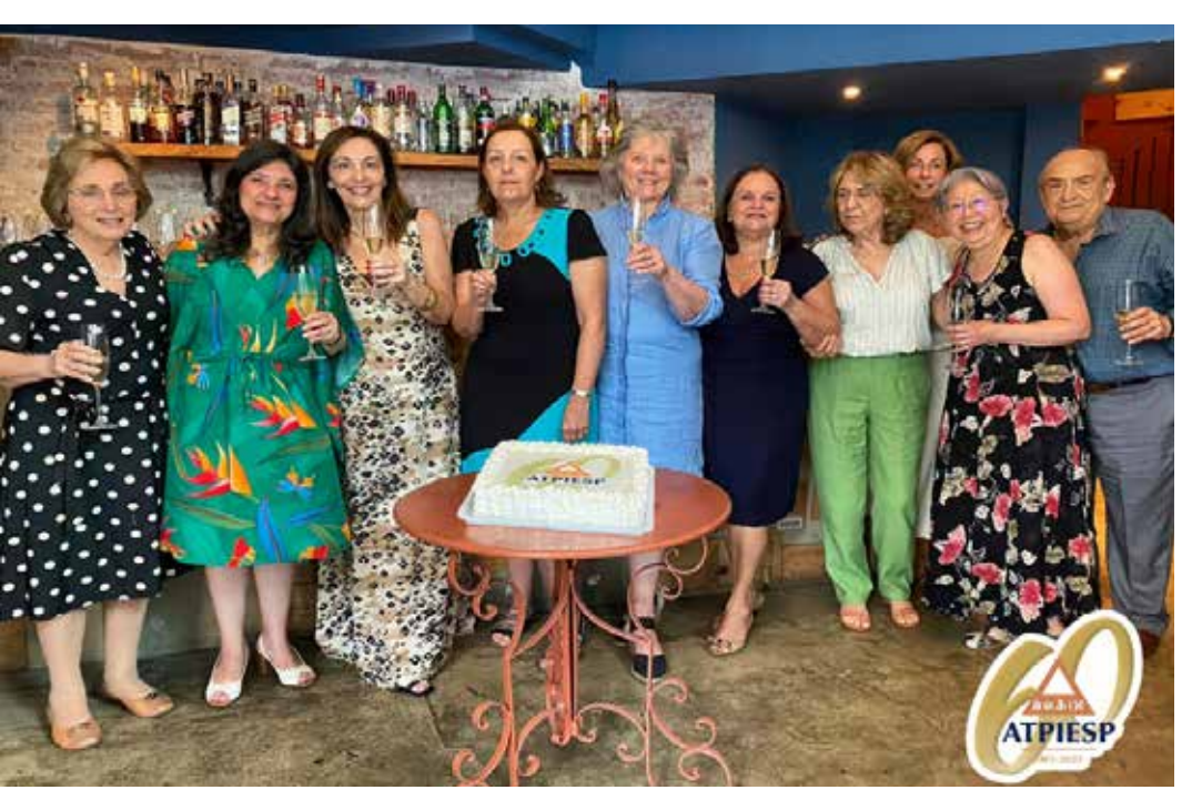
ATPIESP members celebrating 60 years